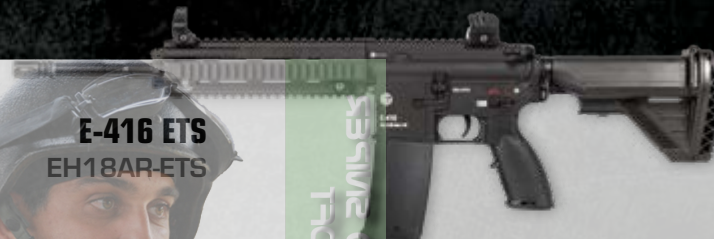
E-416 ETS EH18AR-ETS