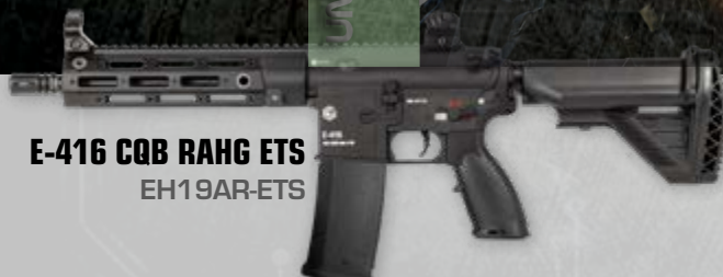
E-416 CQB RAHG ETS EH19AR-ETS