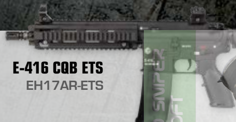
E-416 CQB ETS EH17AR-ETS